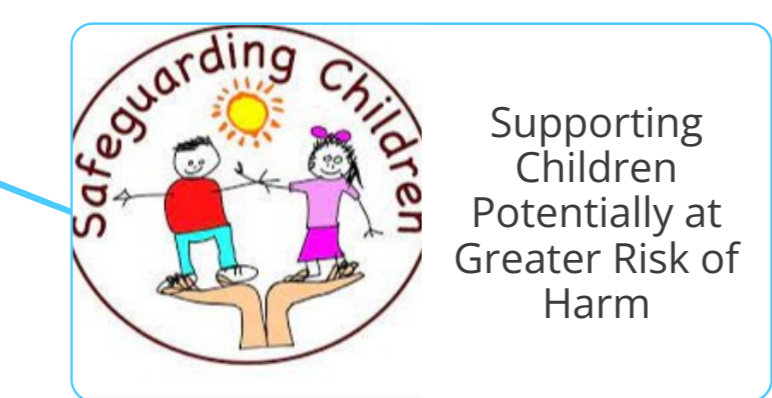
Supporting Children Potentially at Greater Risk of Harm