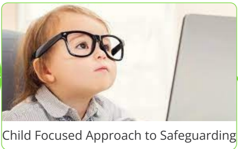
Child Focused Approach to Safeguarding