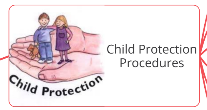
Child Protection Procedures