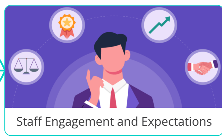
Staff Engagement and Expectations